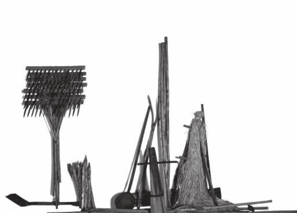
Pino Pascali, AGRICULTURAL TOOLS, 1968, groups of tools, rough wood, straw

In all of Pascali’s work, his clear propensity towards transformation clearly emerges, a mode that bestowed an artistic trajectory that was a tightrope, very short but nevertheless incendiary. This was a consequence of his reputation as an enfant terrible , a term that perfectly reflected his explosive temperament, irony, propensity for playfulness and fun, but also his extraordinary inventive capacity, which meant that he was able to make a significant mark on western contemporary art in under five years. With his implacable creative fury, he burst into galleries, and his shows followed unceasingly one after the other. All this in less than five years, from January 1965, when he had his first one-man show at the La Tartaruga in Rome, to 30 August 1968 (the day of his accident).